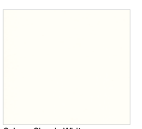
Colour: Classic White Finish: Texture