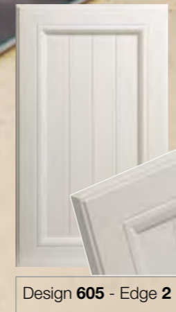
Design 605 - Edge 2

HERITAGE door designs can be produced in Texture, Woodgrain, Matt, and Printed vacuum formed vinyl ( Not available in Gloss Vinyl ), see page 30 for vinyl colour selection. These designs are also suitable for all painted colours and finishes.