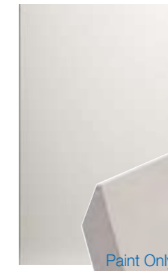
*Design 233 - Edge 3S