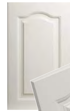
Design 487 - Edge 3