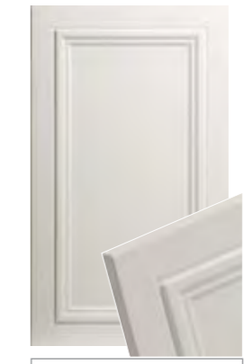
Design 631 - Edge 3S