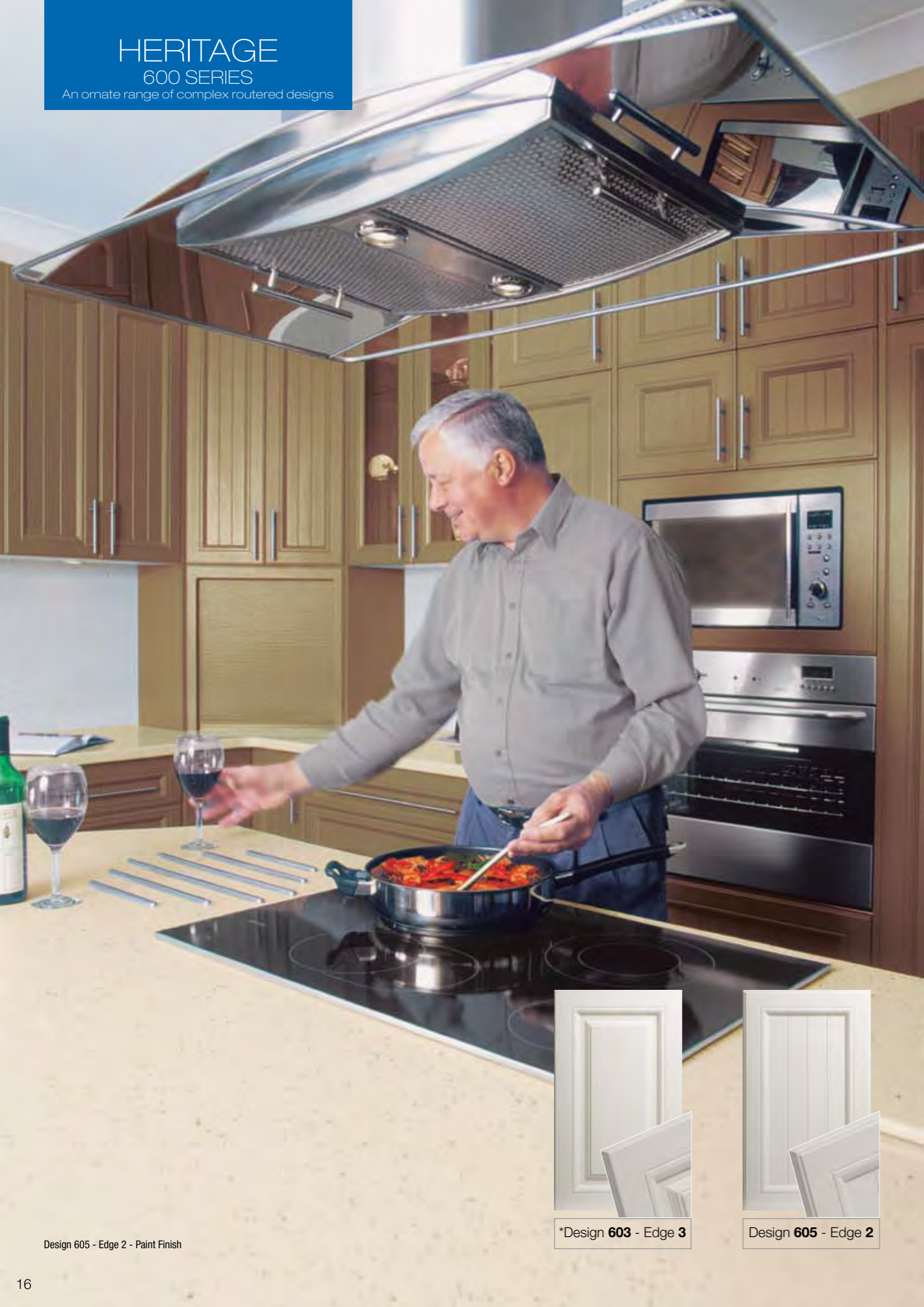
Design 605 - Edge 2 - Paint Finish