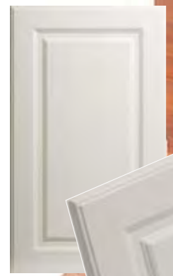
Design 422 - Edge 2