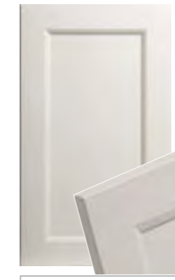
Design 606 - Edge 3