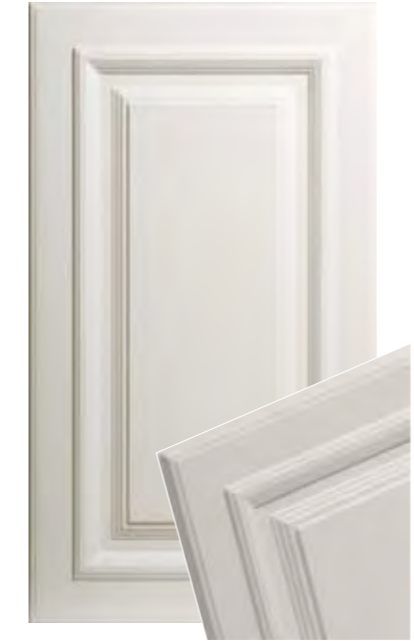
Design 600 - Edge 2

HERITAGE door designs can be produced in Texture, Woodgrain, Matt, and Printed vacuum formed vinyl ( Not available in Gloss Vinyl ), see page 30 for vinyl colour selection. These designs are also suitable for all painted colours and finishes.