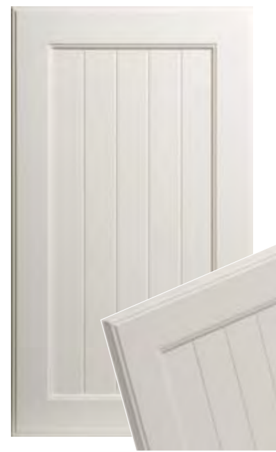
Design 576 - Edge 2