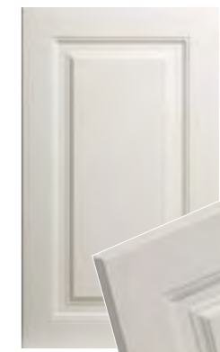
Design 486 - Edge 3