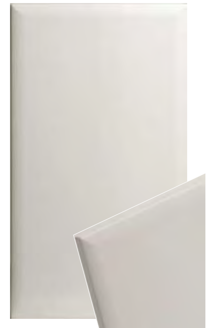
Design 100 - Edge 19