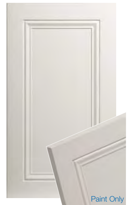
*Design 634 - Edge 3S