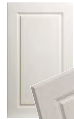
Design 434 - Edge 3