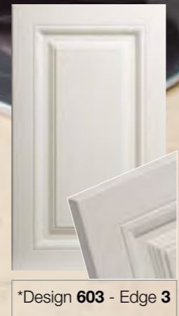
*Design 603 - Edge 3