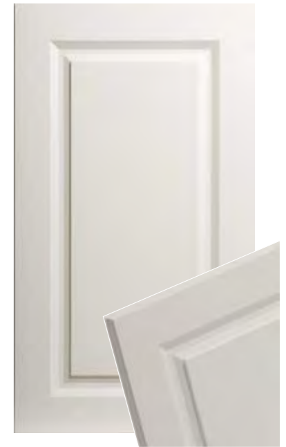
Design 412 - Edge 3S