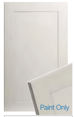
*Design 520 - Edge 3