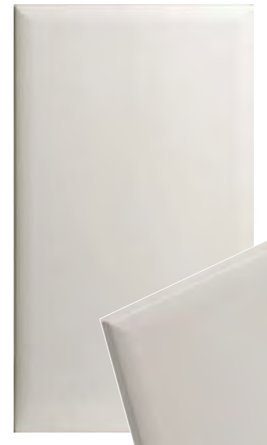
Design 100 - Edge 19