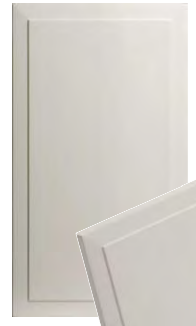
Design 100 - Edge 17