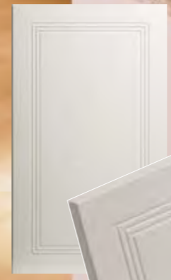
Design 223 - Edge 3

TRADITIONAL door designs can be produced in Texture, Woodgrain, Matt, Printed and Gloss vacuum formed vinyl, see page 30 for vinyl colour selection. These designs are also suitable for all painted colours and finishes.