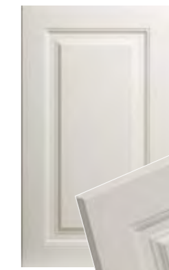
Design 486 - Edge 3