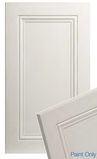
*Design 634 - Edge 3S