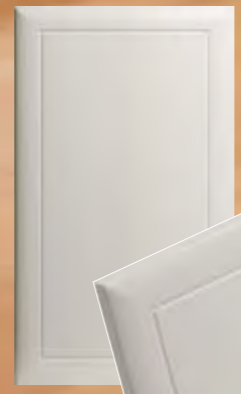
Design 219 - Edge 19