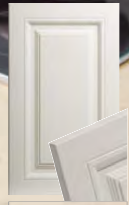
*Design 603 - Edge 3