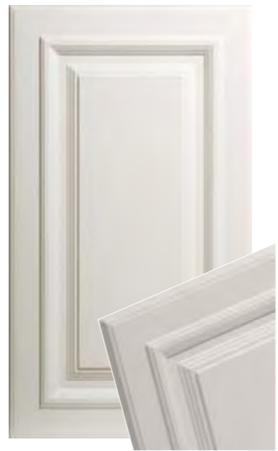
Design 600 - Edge 2

HERITAGE door designs can be produced in Texture, Woodgrain, Matt, and Printed vacuum formed vinyl ( Not available in Gloss Vinyl ), see page 30 for vinyl colour selection. These designs are also suitable for all painted colours and finishes.