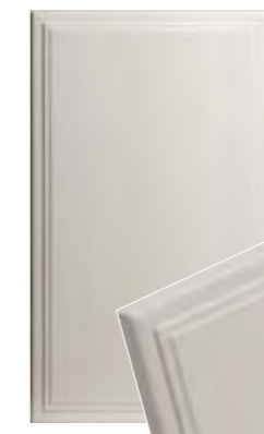
Design 100 - Edge 14