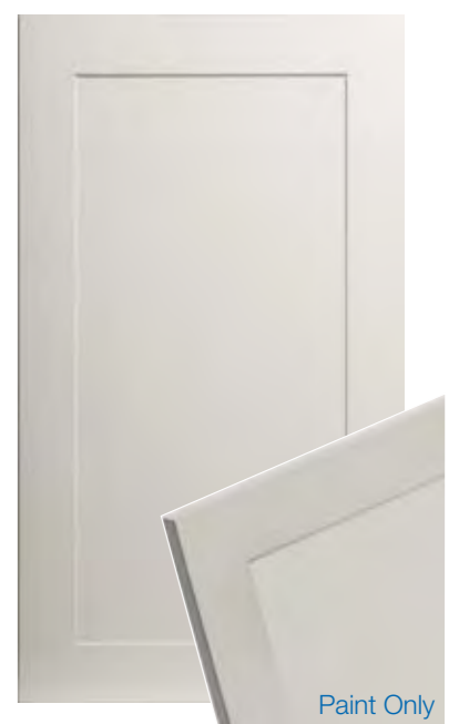
*Design 560 - Edge 3S