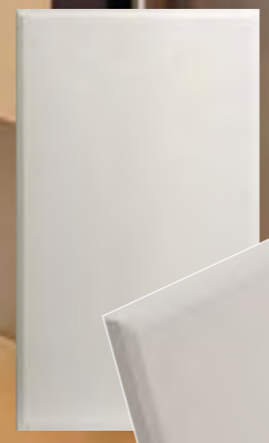
Design 100 - Edge 4