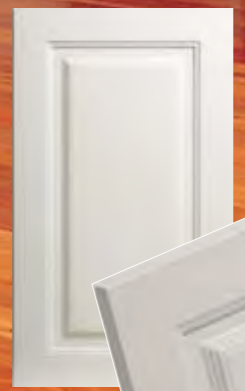
Design 426 - Edge 3