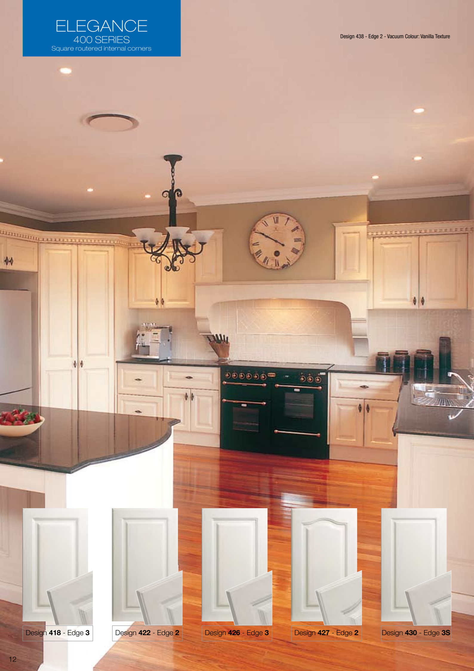
Design 438 - Edge 2 - Vacuum Colour: Vanilla Texture

ELEGANCE door designs can be produced in Texture, Woodgrain, Matt, Printed and Gloss vacuum formed vinyl, see page 30 for vinyl colour selection. These designs are also suitable for all painted colours and finishes.