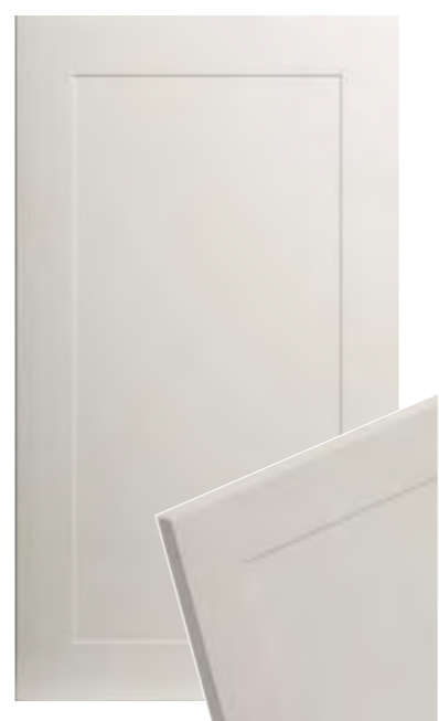
Design 502 - Edge 3S

COUNTRY door designs can be produced in Texture, Woodgrain, Matt, and Printed vacuum formed vinyl ( Not available in Gloss Vinyl ), see page 30 for vinyl colour selection. These designs are also suitable for all painted colours and finishes.