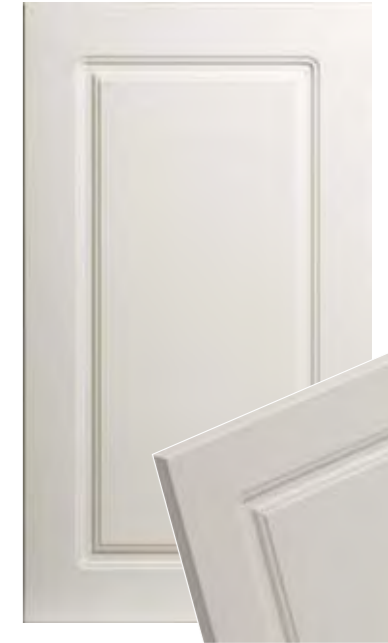
Design 200 - Edge 3