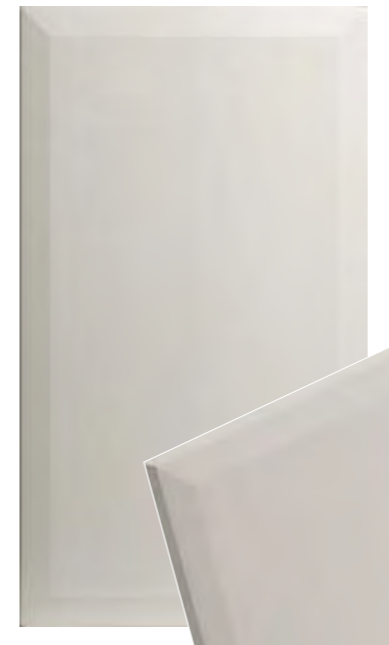
Design 100 - Edge 16