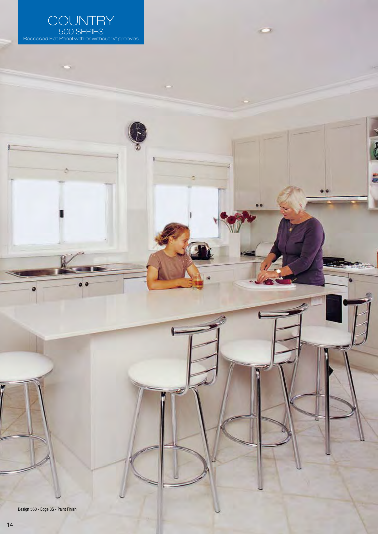
Design 560 - Edge 3S - Paint Finish

COUNTRY door designs can be produced in Texture, Woodgrain, Matt, and Printed vacuum formed vinyl ( Not available in Gloss Vinyl ), see page 30 for vinyl colour selection. These designs are also suitable for all painted colours and finishes.