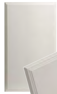
Design 100 - Edge 5