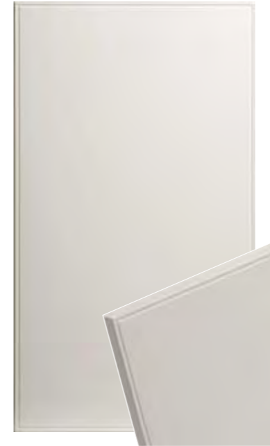
Design 260 - Edge 3S

TRADITIONAL door designs can be produced in Texture, Woodgrain, Matt, Printed and Gloss vacuum formed vinyl, see page 30 for vinyl colour selection. These designs are also suitable for all painted colours and finishes.