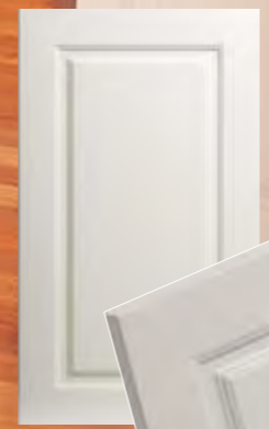
Design 430 - Edge 3S