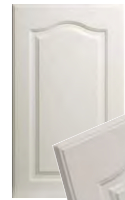
Design 439 - Edge 2