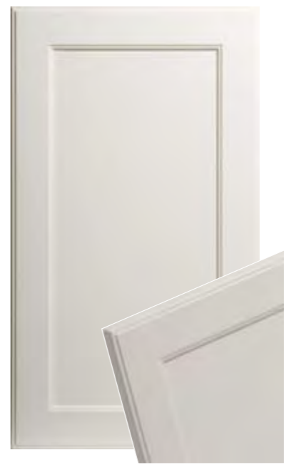
Design 575 - Edge 2