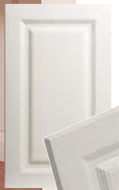
Design 418 - Edge 3