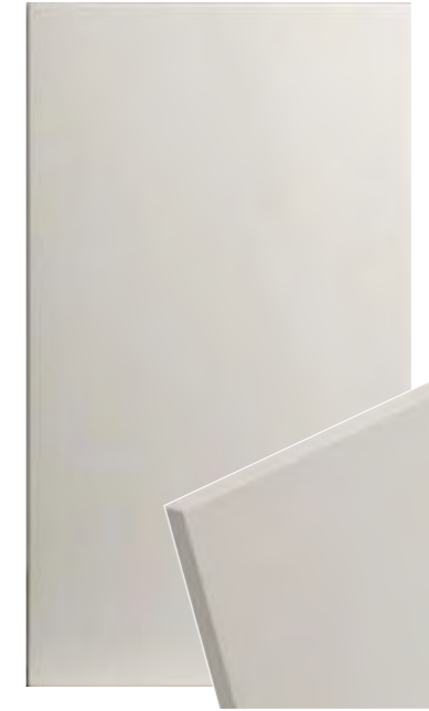
Design 100 - Edge 3S