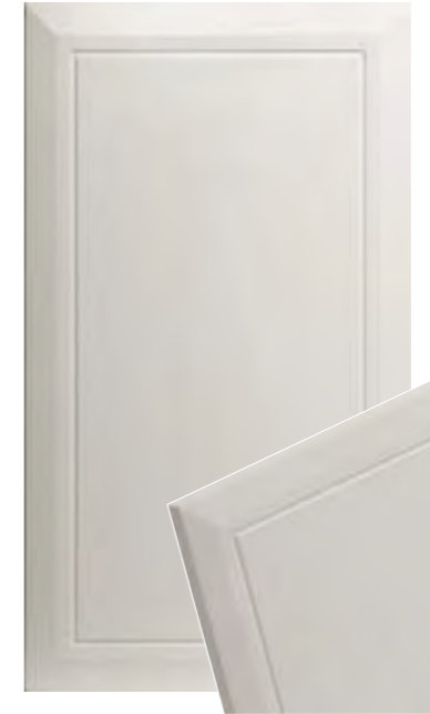
Design 219 - Edge 16