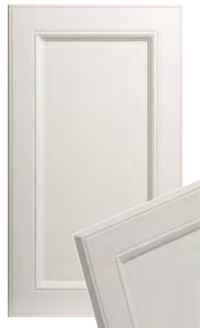
Design 609 - Edge 3