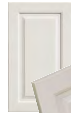
Design 484 - Edge 3S