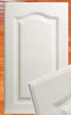
Design 427 - Edge 2