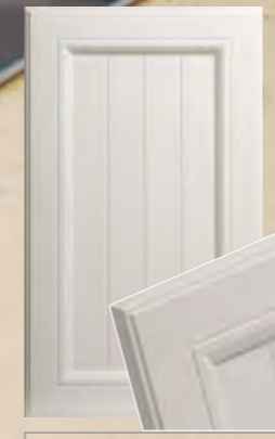
Design 605 - Edge 2