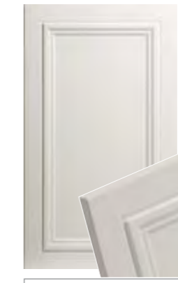
Design 631 - Edge 3S