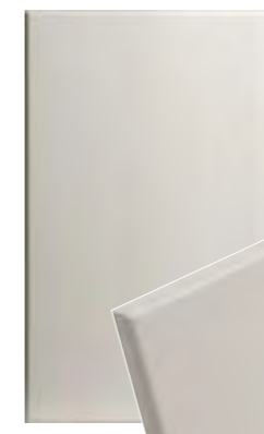
Design 100 - Edge 6