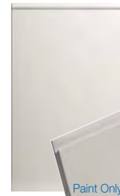
*Design 230 - Edge 3 Paint Only