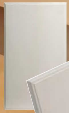
Design 100 - Edge 2