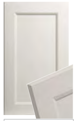
Design 606 - Edge 3