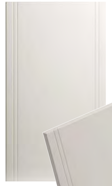
Design 208 - Edge 3