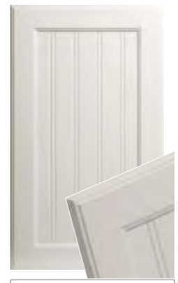
Design 576DVG - Edge 2