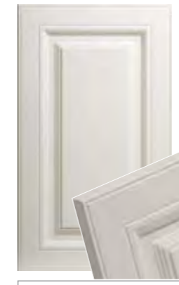
Design 623 - Edge 3