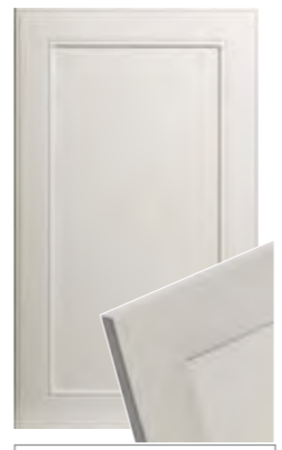
Design 506 - Edge 3