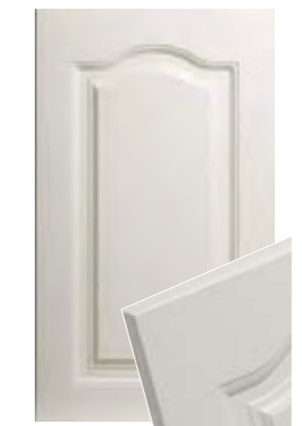
Design 487 - Edge 3