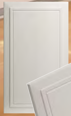
Design 219 - Edge 17