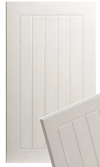
Design 276 - Edge 3S