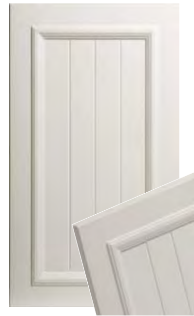
Design 602 - Edge 3