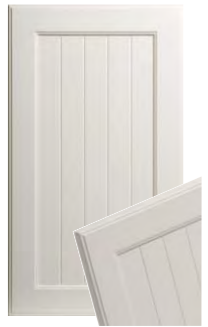
Design 576 - Edge 2