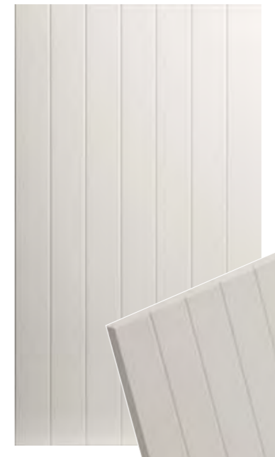
Design 212 - Edge 3S