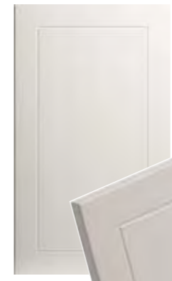
Design 275 - Edge 3S